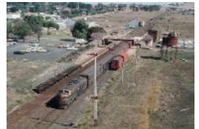
Sunbury Station (4 of 4) taken from top of grain silo, 1976